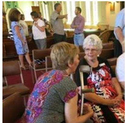
Chatting after morning tea....