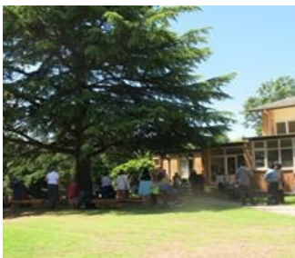
Christmas Day lunch on the Church lawns