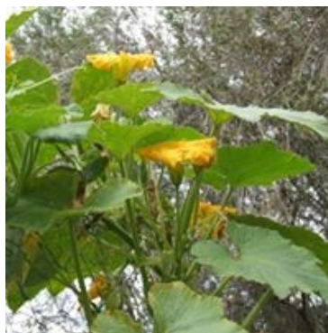
In the community garden see report page 24