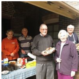
The Sunday Explorers and some of the delicious fare they create